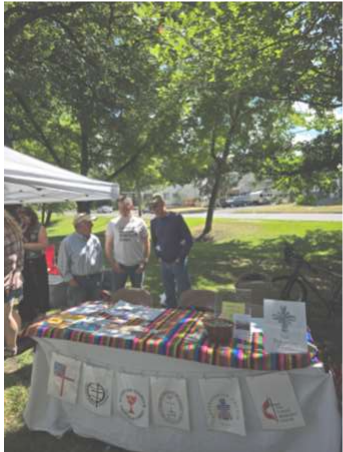
FPC shared a table with The Center at the August 2024 Palouse Pride Festival. Free compliments were given to guests.

DONATIONS CAN BE DROPPED OFF AT THE SOJOURNER'S OFFICE AT 627 N VAN BUREN MOSCOW, IDAHO